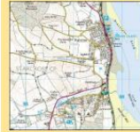
Starcross, Exe Estuary