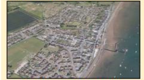
Starcross, Exe Estuary, South West England